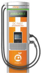
Express 250 Station with 2 x 31.25 kW Power Modules