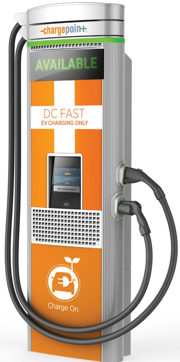
Express 250 Station